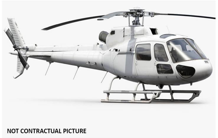
NOT CONTRACTUAL PICTURE